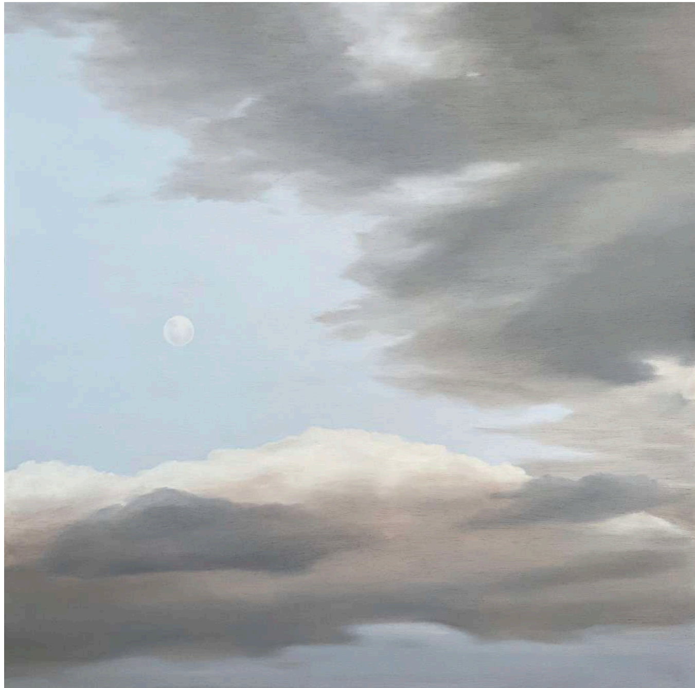
In the Pale Sky Oil on plywood, black Tasmanian oak frame 73 x 73 cm $2,400