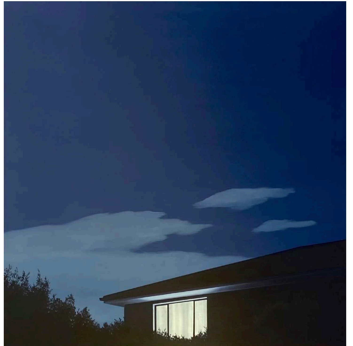
Sinking into Night Oil on plywood, black Tasmanian oak frame 83 x 83 cm $3,200