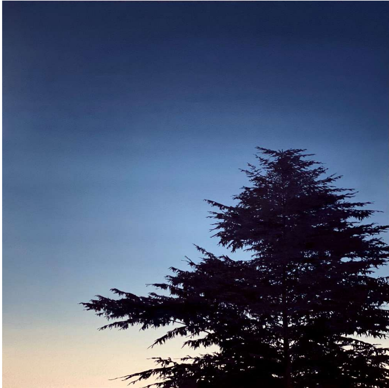
Evening Sky Oil on plywood, black Tasmanian oak frame 63 x 63 cm $1,800