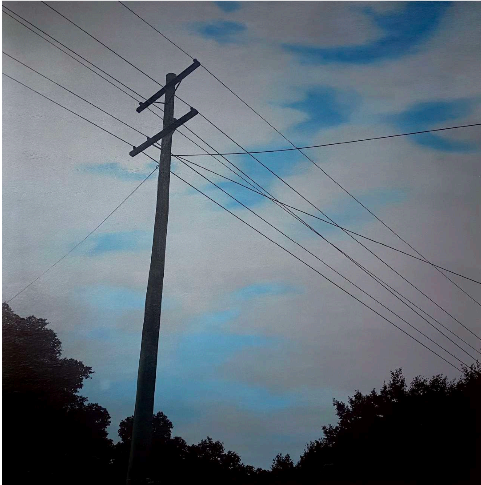
Silent Shadows Oil on plywood, black Tasmanian oak frame 103 x 103 cm $4,800