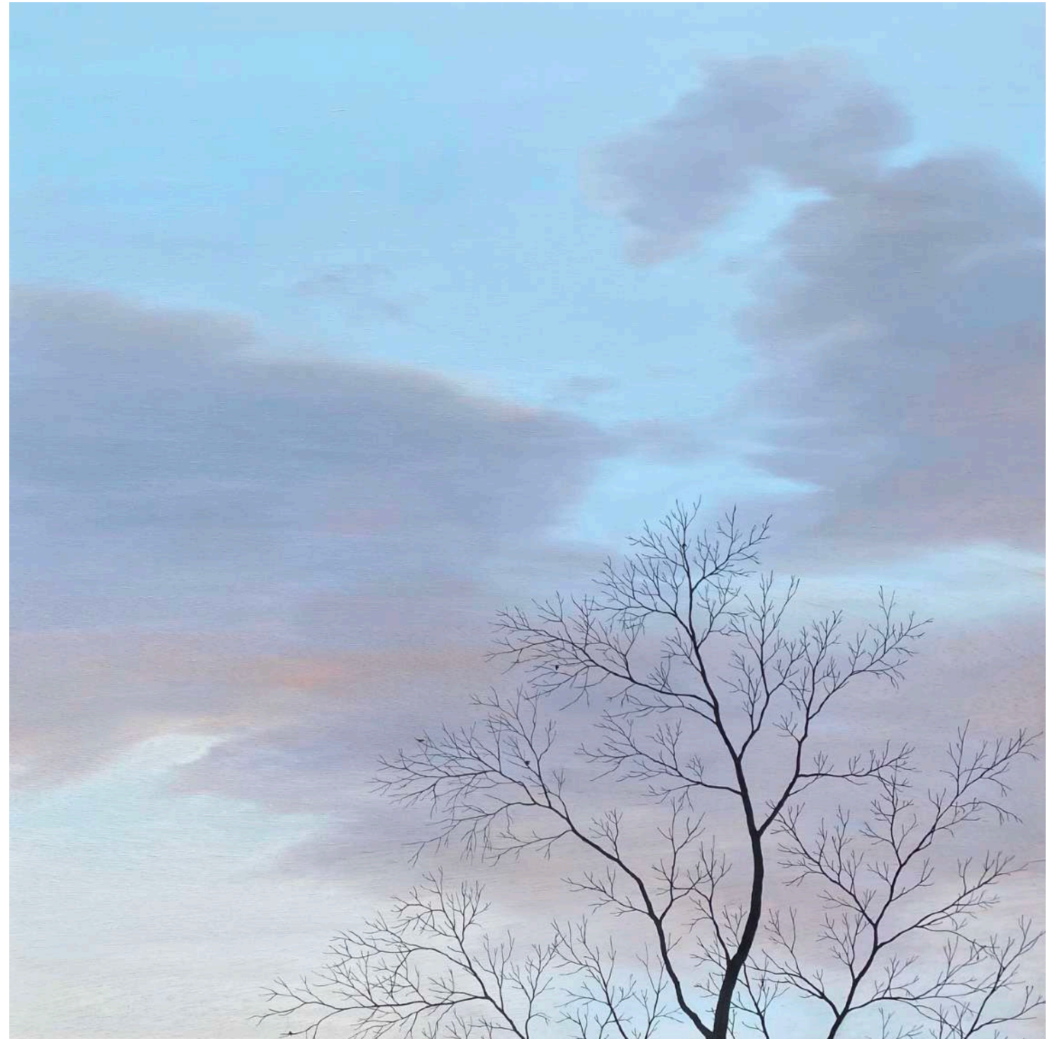
Against the Winter Sky Oil on plywood, black Tasmanian oak frame 83 x 83 cm $3,200