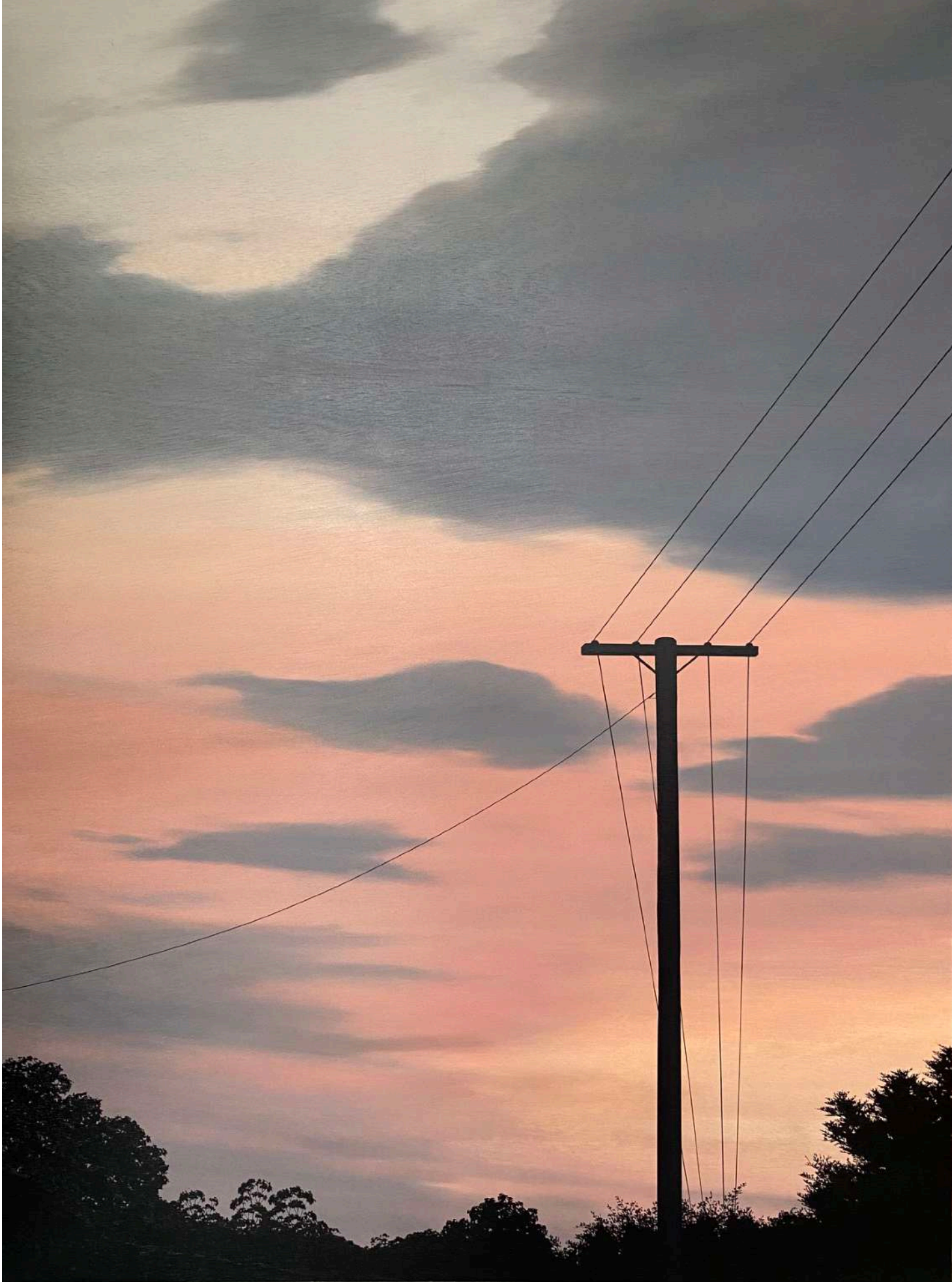
Rosy Dusk Oil on plywood, black Tasmanian oak frame 93 x 123 cm $5,200