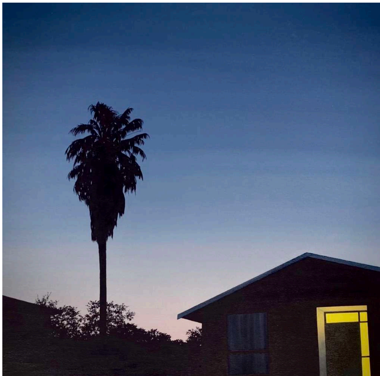
Holding on to Light Oil on plywood, black Tasmanian oak frame 63 x 63 cm $1,800