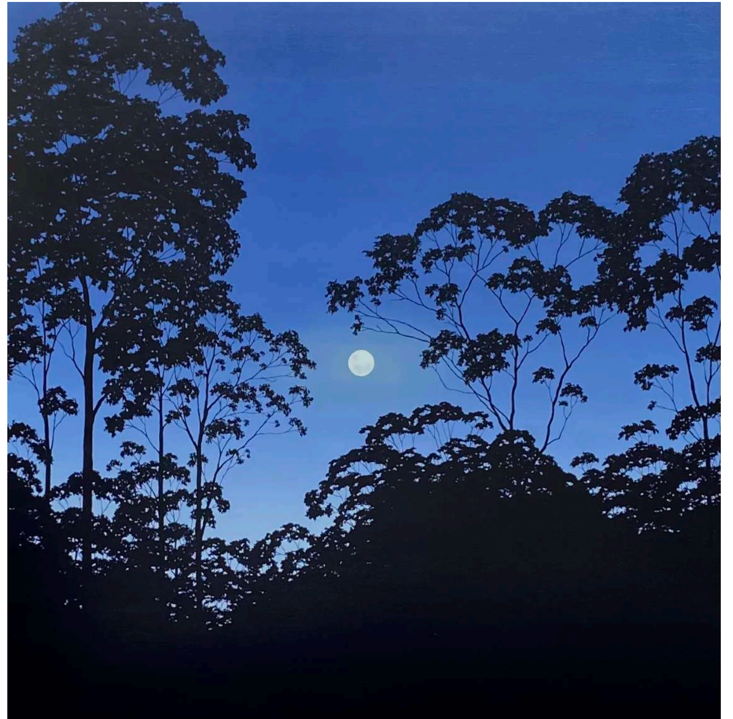
Blue Moon Oil on plywood, black Tasmanian oak frame 93 x 93 cm $3,900