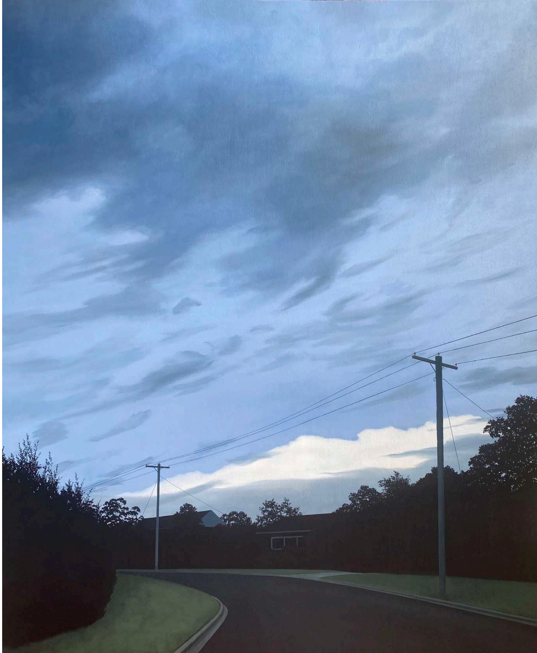
Light, yet Dark Oil on plywood, black Tasmanian oak frame 110 x 130 cm $6,400