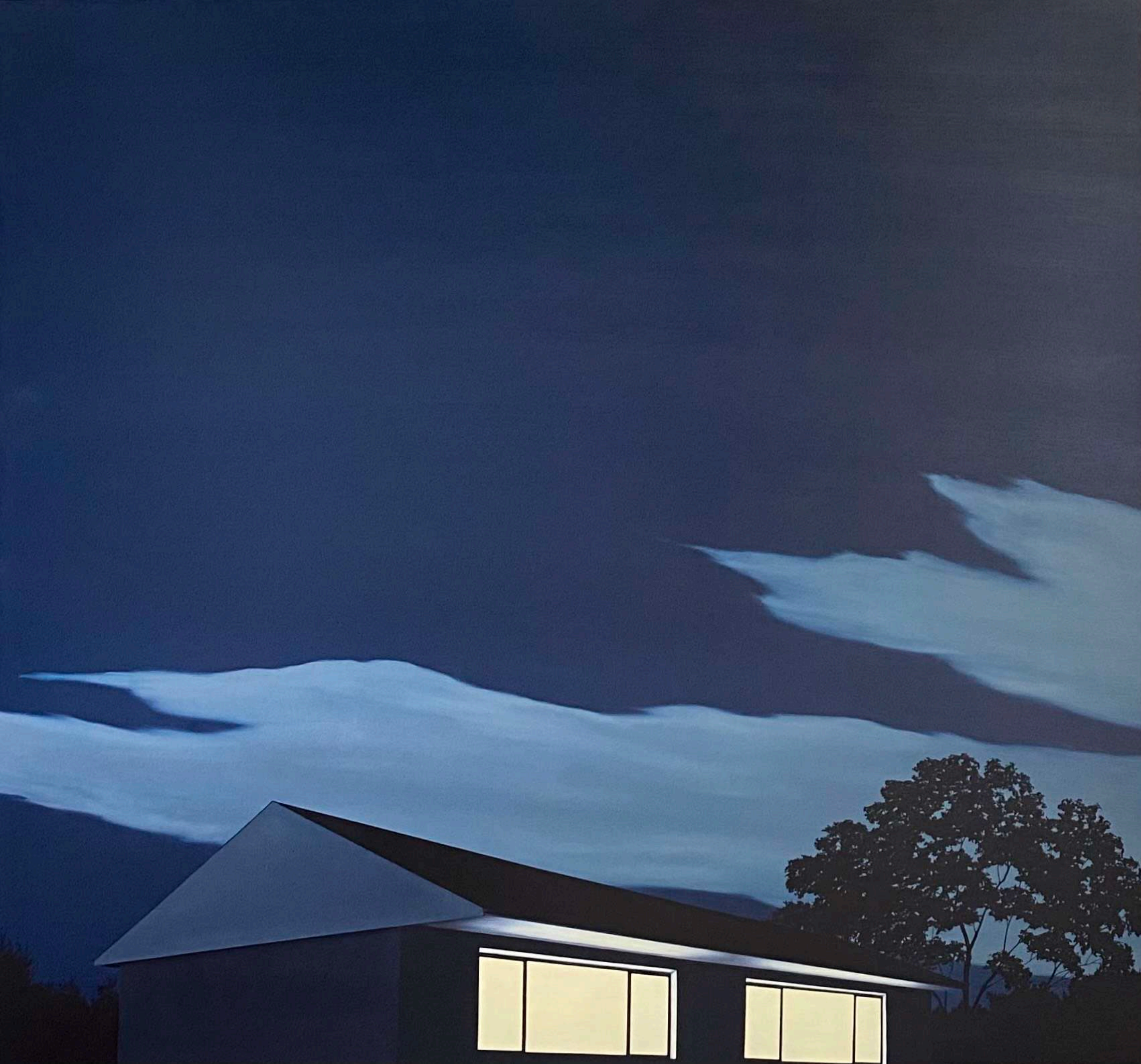
Nightfall Oil on plywood, black Tasmanian oak frame 130 x 120 cm $6,800