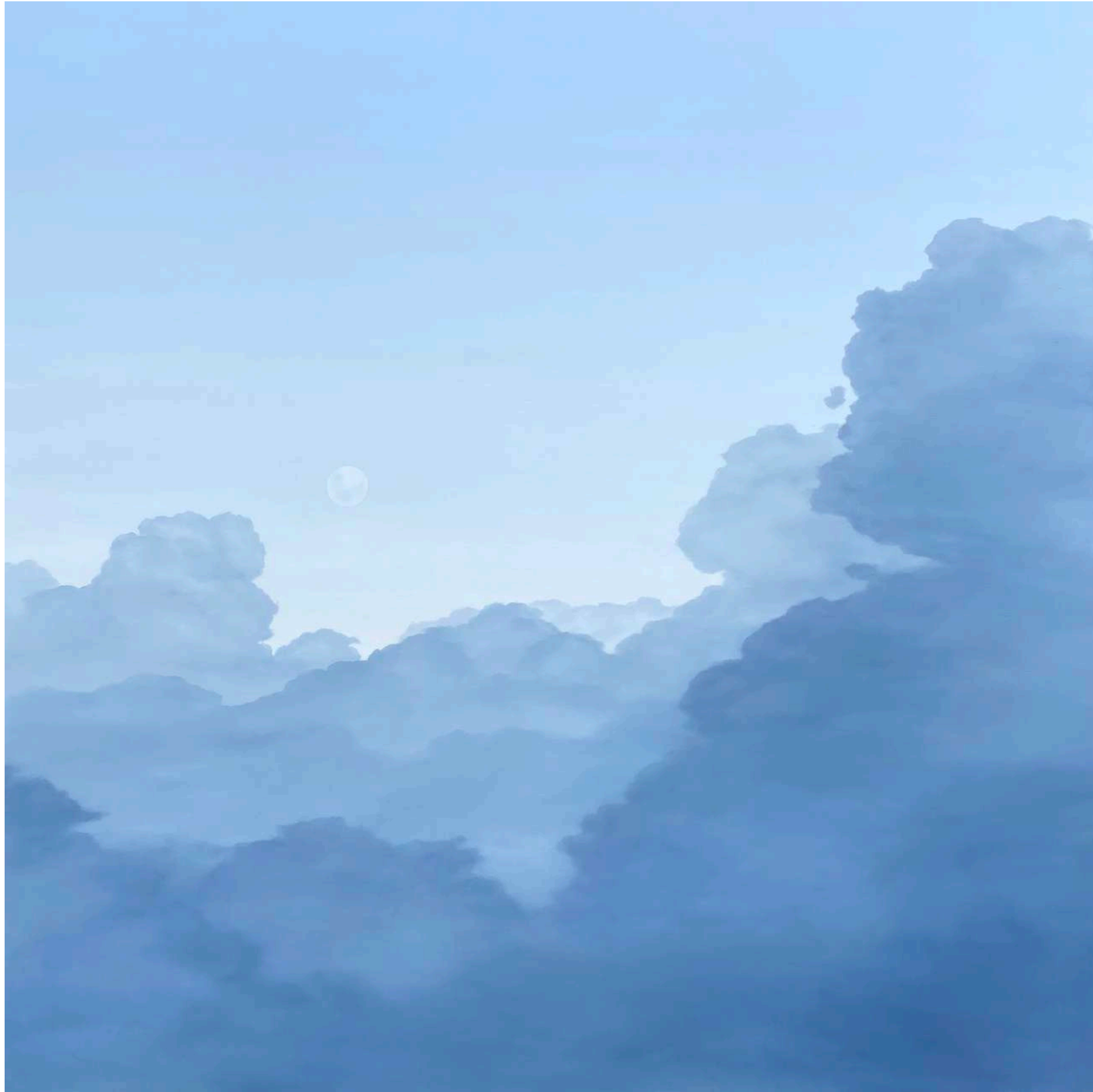
Moon Rise Oil on plywood, black Tasmanian oak frame 103 x 103 cm $4,800