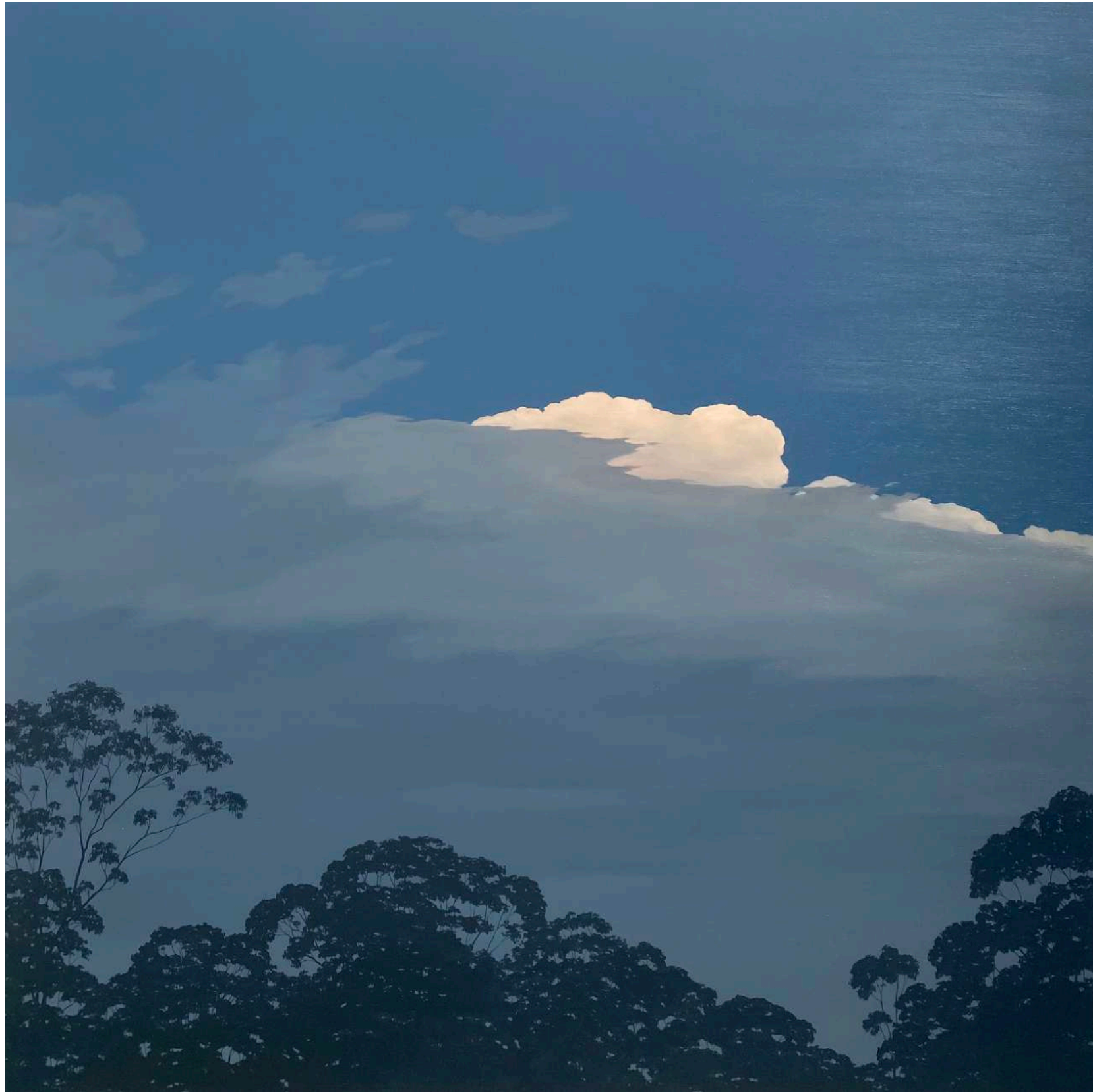
Up Above Oil on plywood, black Tasmanian oak frame 103 x 103 cm $4,800